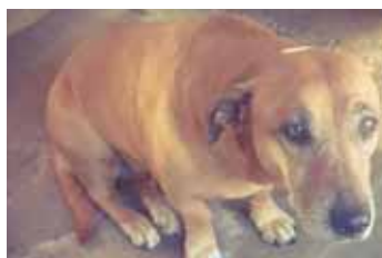
Female cross breed, around five years old, waiting in kennel I3.

For more information contact the Rustenburg Society for the Prevention of Cruelty to Animals (SPCA) office on 014 592 3181 or admin@spcartb.org.za.