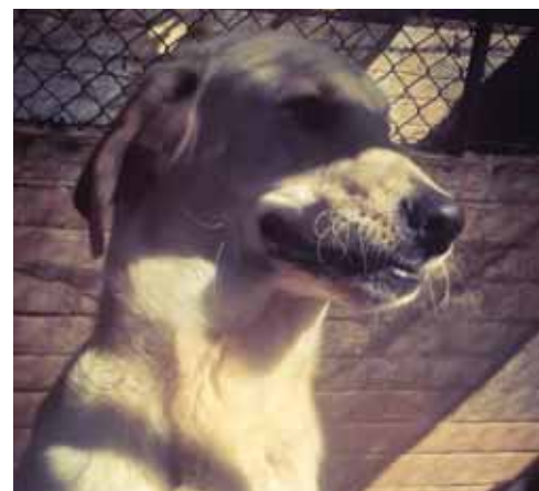
Male Labrador, around two years old, waiting for his forever-home in kennel M5.